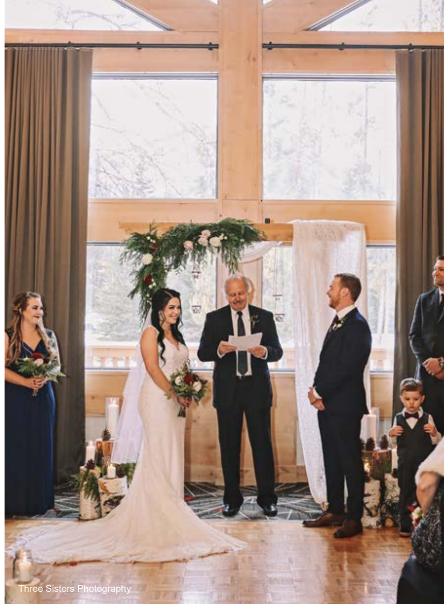
Three Sisters Photography