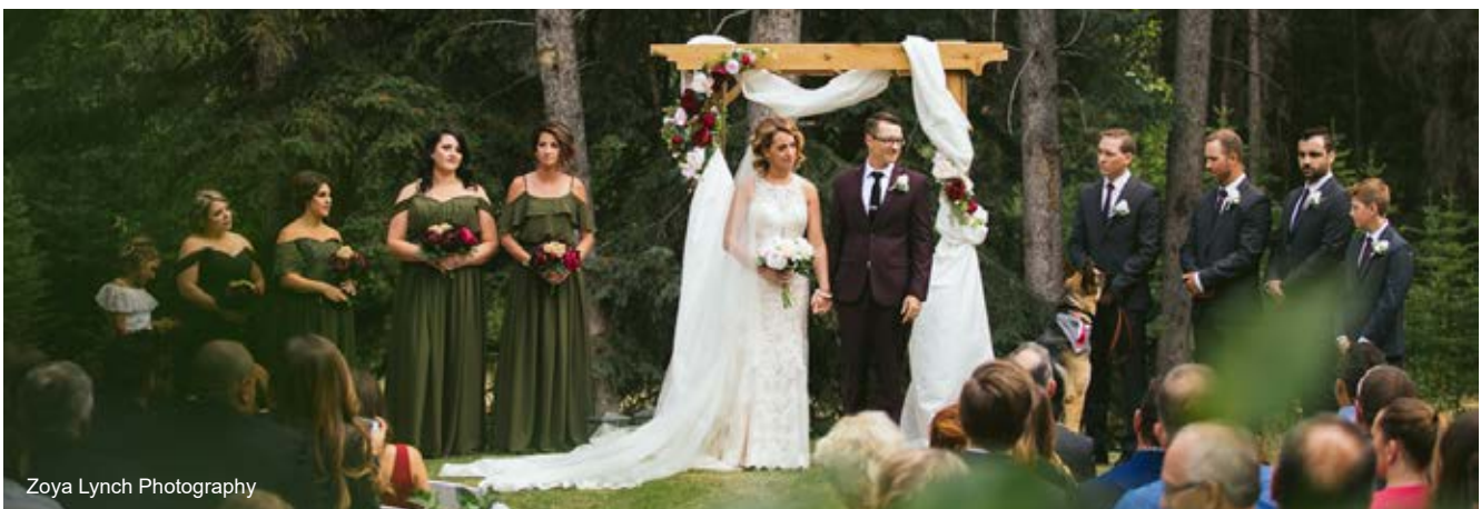
Zoya Lynch Photography

Public Ceremony Sites · banff.ca/Weddings (403) 762-1235 · rentals@Banff.ca